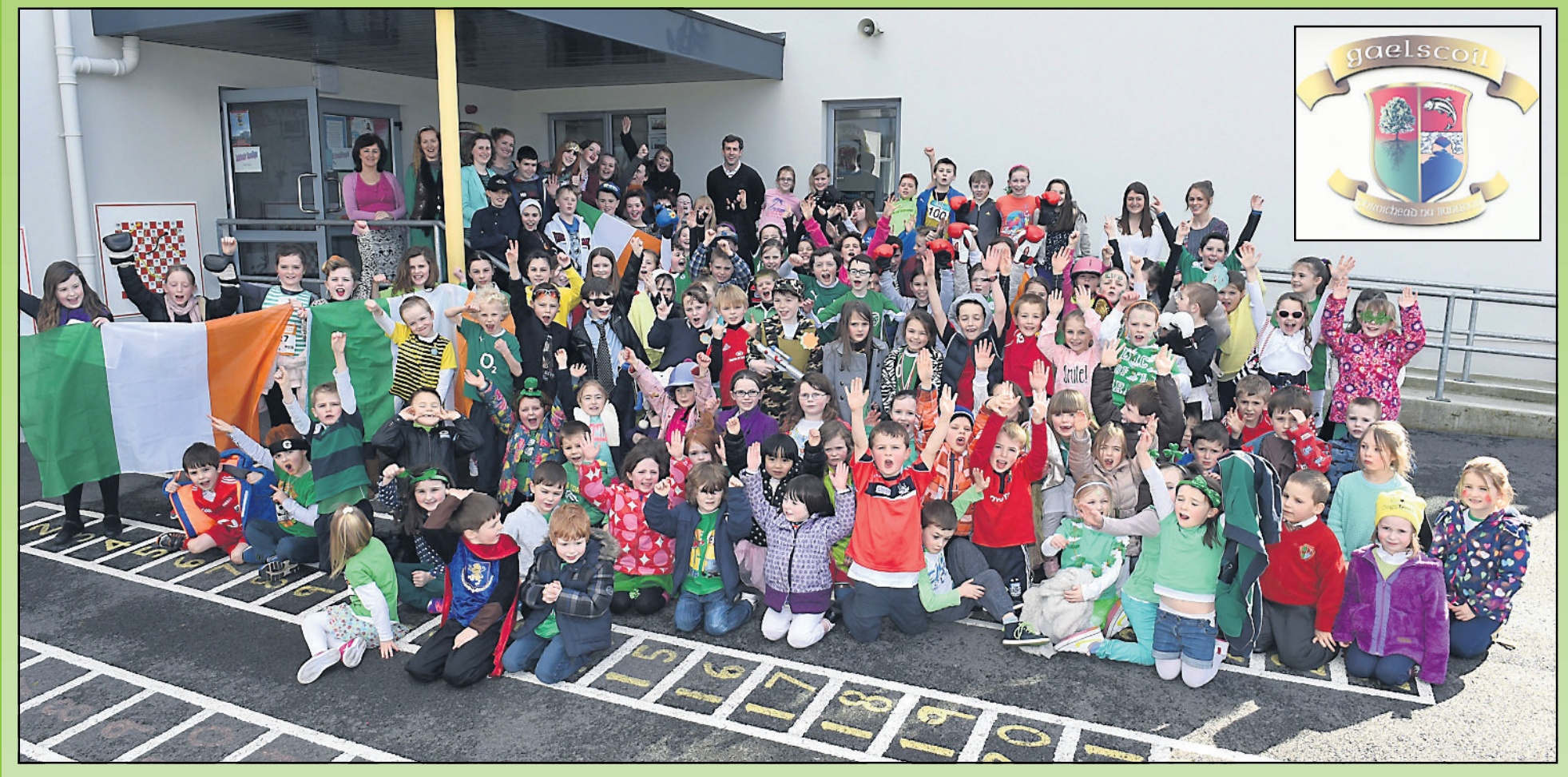
Pupils and staff at Gaelscoil Dhroichead na Banndan dressed up for the St Patrick's Day celebrations at the school. See pages six and seven for more pictures.